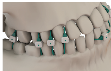
Minne Ties dental occlusion ties

She was left in the maxillomandibular fixation with Minne Ties for a total of two weeks and returned for follow-up. The ties did not loosen and she tolerated them very well. She reported that she hadn't taken any Tylenol or NSAIDs at all for the second week post-treatment. She reported mild dental pain and no jaw pain.